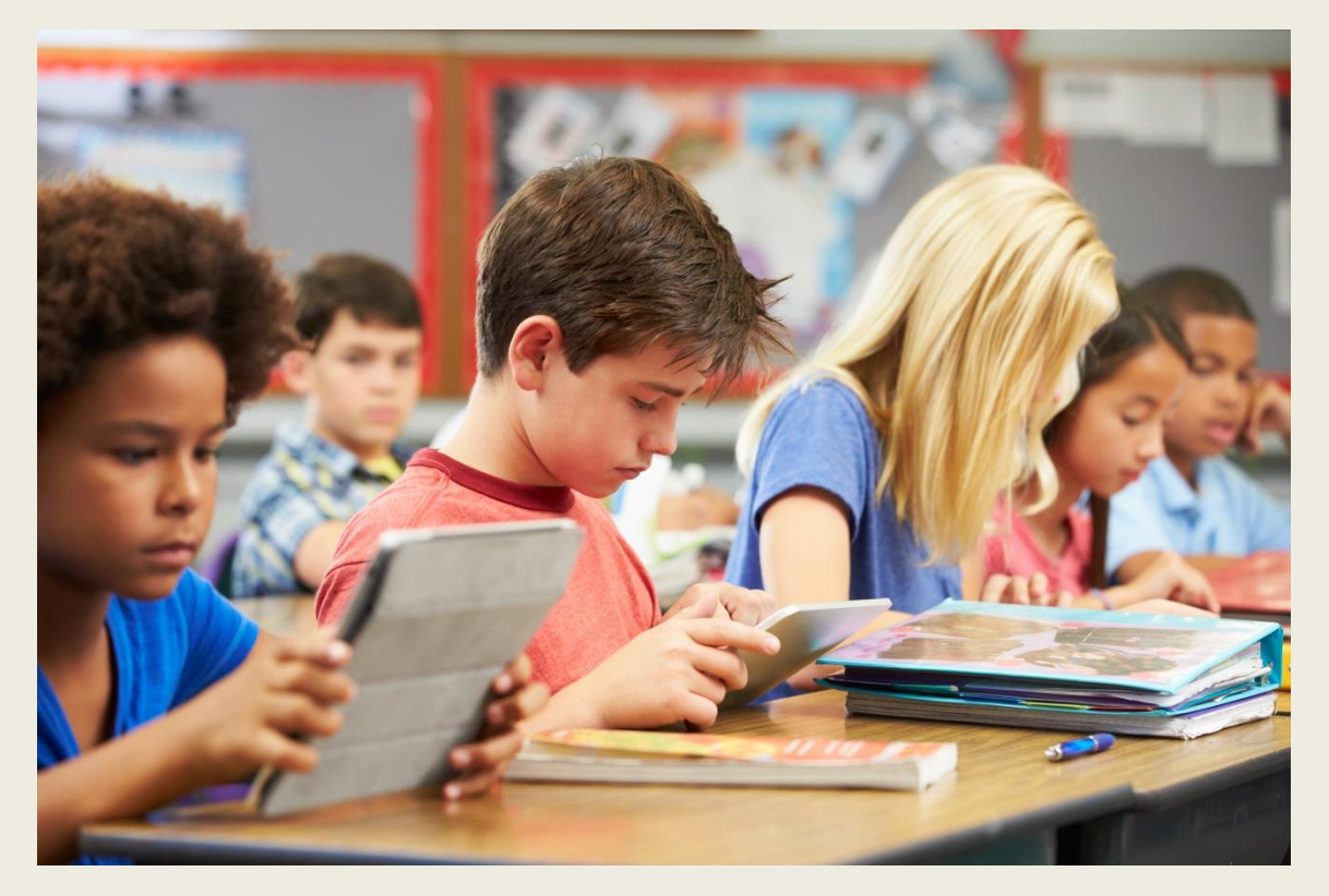
School Safety & Discipline Data Reporting 2017-18