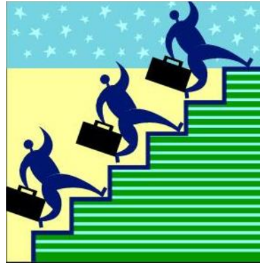
Top 5 Industries SUS Bachelor Degree Graduates